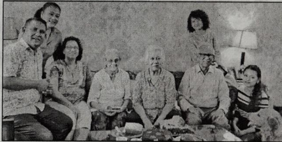
A family photograph taken on his 83rd birthday.

Ans: Fighting a case in the Supreme Court is a stupendous challenge for first timers. The first challenge was to get the petition accepted as many of the PILs