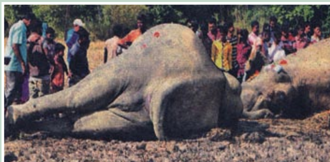
Electrocuted elephants in Gendhali Pothar, near EHHP work area on Dec 11, 2017 (This work area is the killing fields of elephants through electrocution)

To prevent/reduce ‘human-elephant conflict’ by changing the people’s perceptions about elephants and their perceived ideas and feelings about elephant depredation of crops, homes, human and elephant deaths etc. – from anger to understanding and love, – from spears to bananas and tenants of the scriptures.