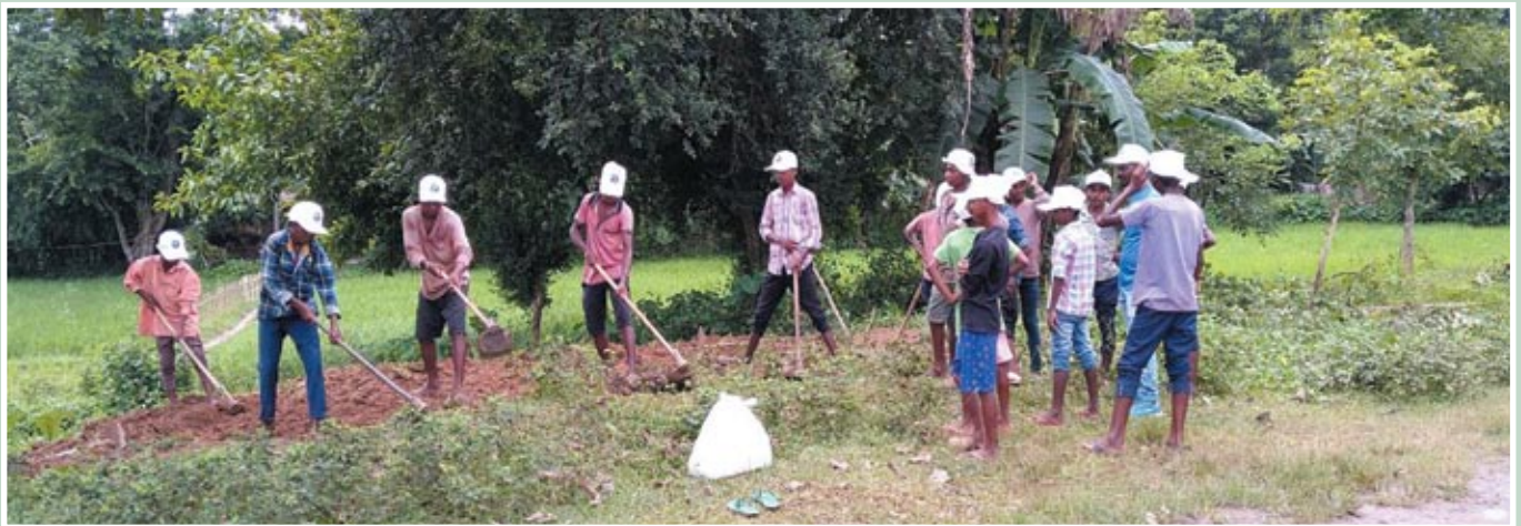
Local school students lowering ground level under dangerously sagging electrical line