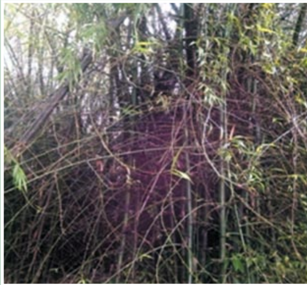
Prickly bamboo (was used by Ahom Kings for fortification) কোকোৰা বাহ

Sources of owtenga and Bhimkol saplings are tied up for timely plantation. Kako bamboo, elephant grass is being collected from Karbi Hills through community effort.