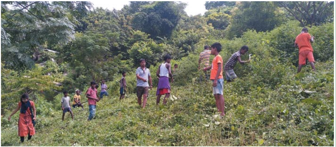
Cleaning of jungle for 'plantation' of bhimkols, owtengas etc. - community's involvement: