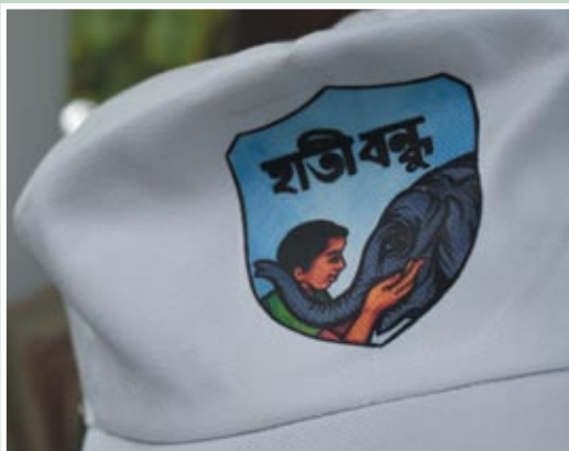
Hati bondhu cap logo