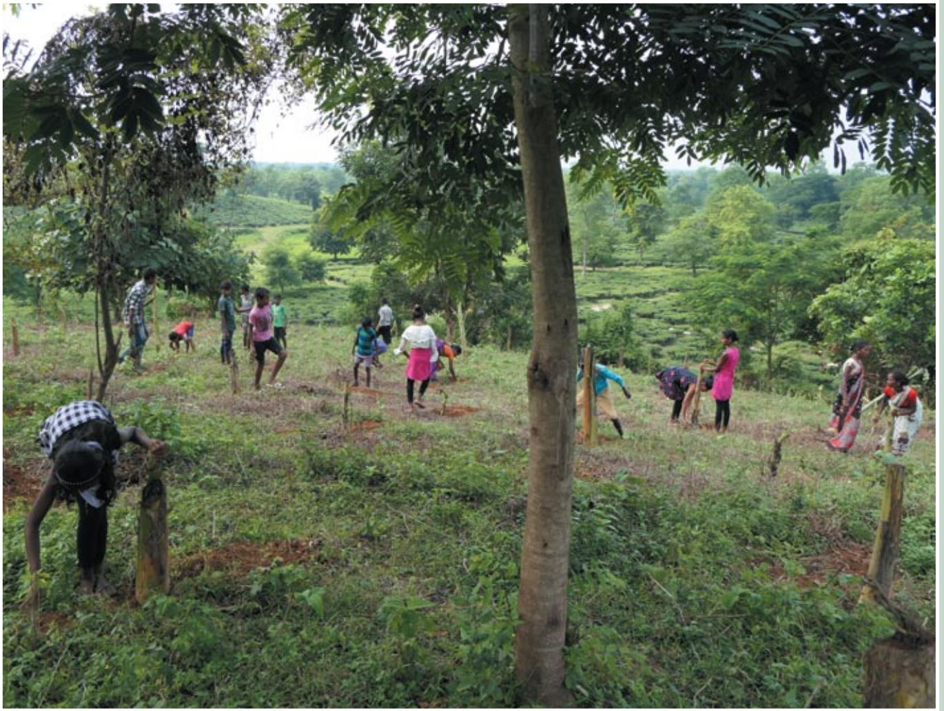
Plantation of bhimkols on 30.09.18 Women and children taking active part