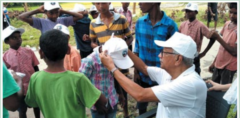
Distribution of "Hati Bondhu caps" to local children