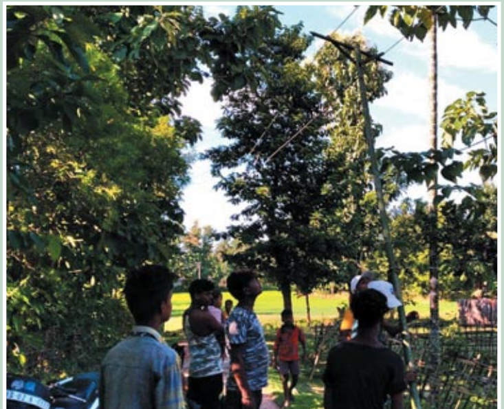
Community's own effort.