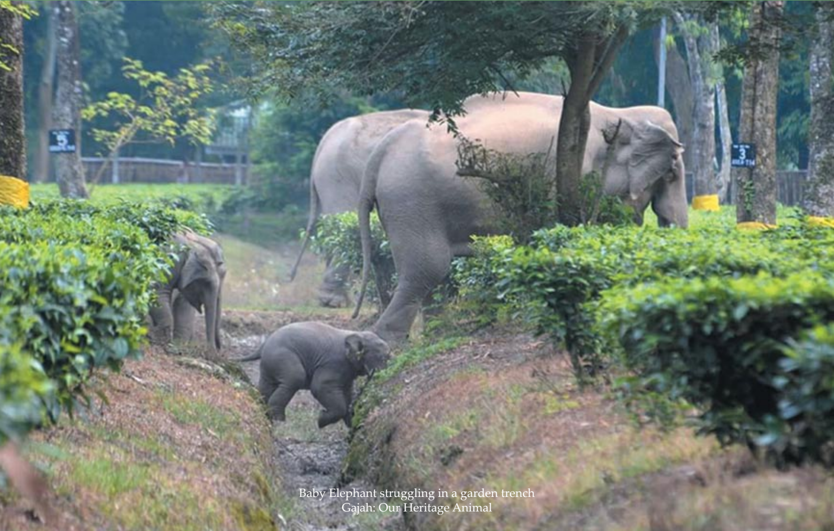
Baby Elephant struggling in a garden trench Gajah: Our Heritage Animal