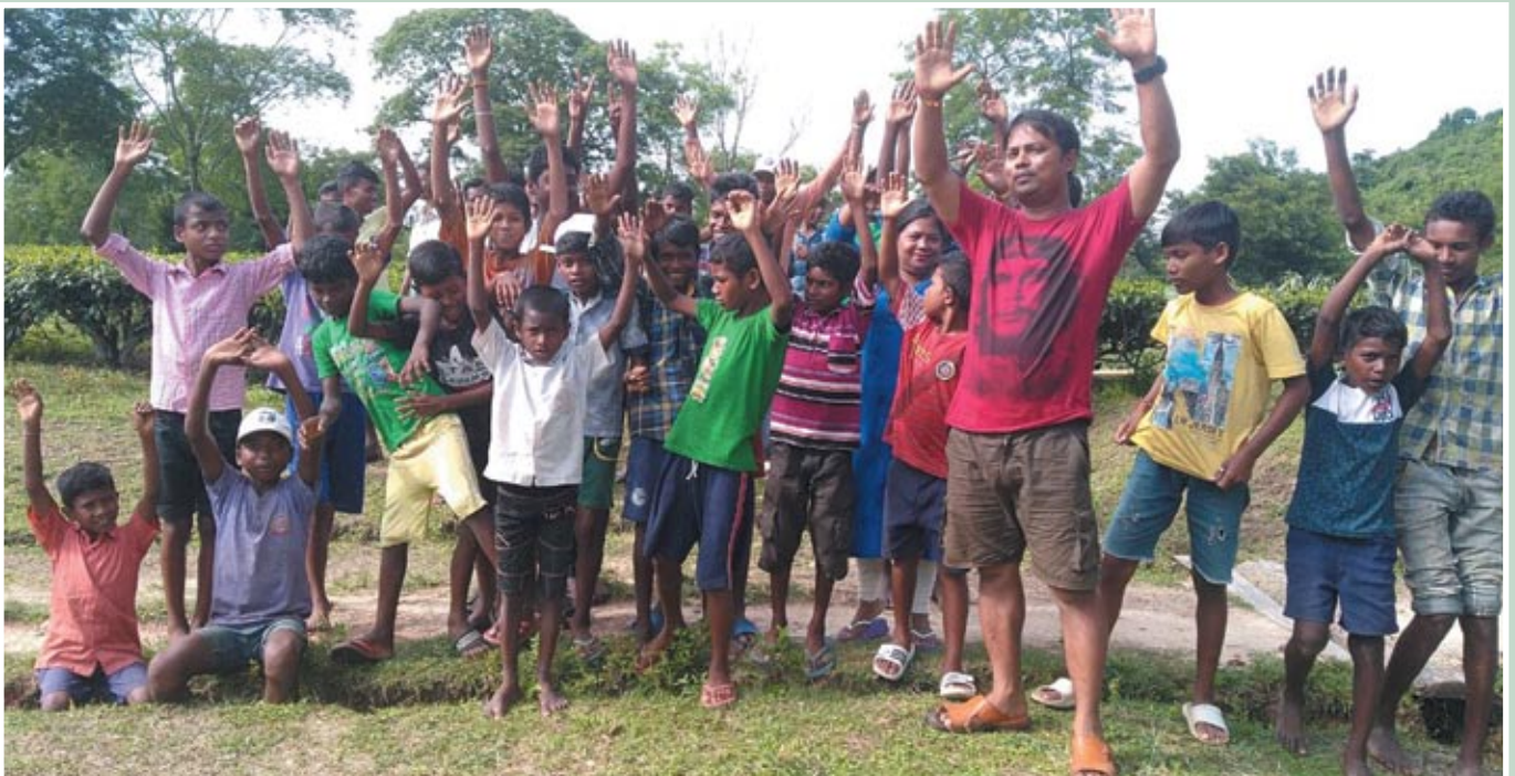
We shall overcome!