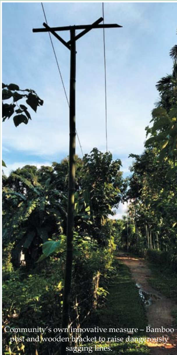
Community's own innovative measure – Bamboo post and wooden bracket to raise dangerously sagging lines.