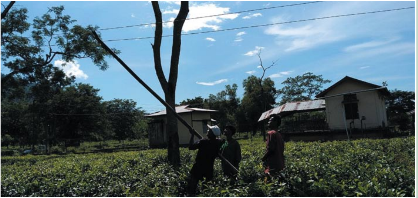
A dangerously sagging line