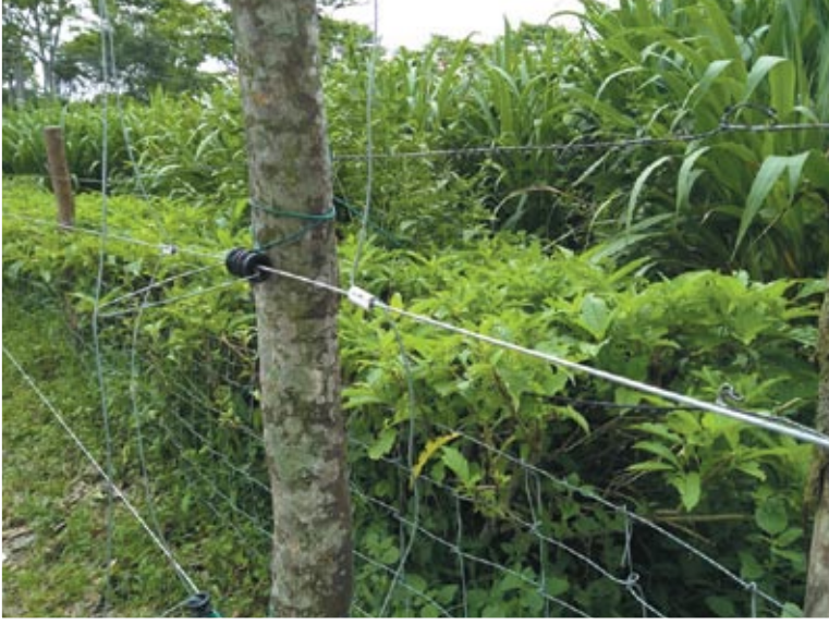
Electric wires and sharp barbed wires along the Guatemala grass cultivation in a tea garden

It will be the endeavour of EHHP to sensitise the tea gardens to extend free passage through to the elephants, to remove all electrical/RBT fencing etc and to make the trenches safe for baby elephants, in short, to take a compassionate and loving attitude towards Gajah, the traditional Heritage Animal of India.