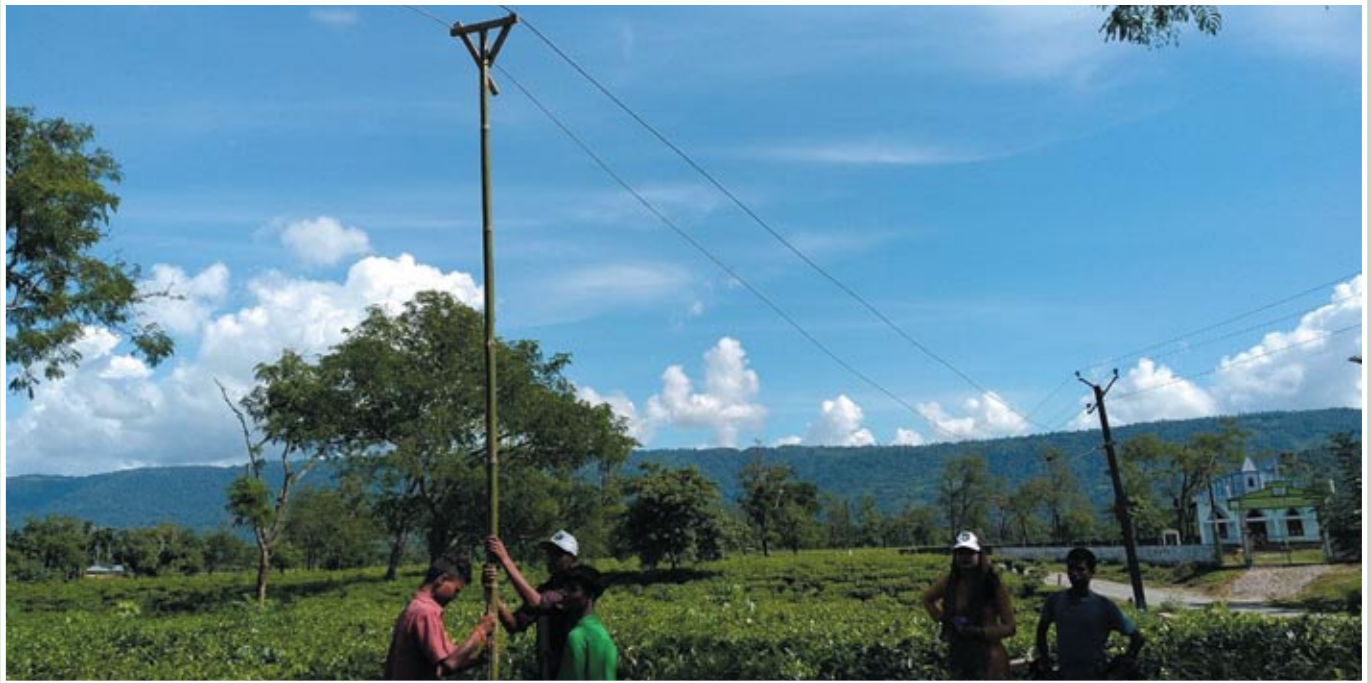
Sagging line inside tea garden after being raised: community's effort