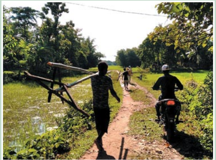
Carrying the post by community