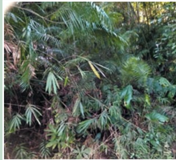
Cane (calamus tenuis)

b) Planting of Bhimkols and other trees as above in a large scale each year, should not be construed as a deterrent for elephants to eye on ripe paddy fields and to raid them for which separate steps will have to be taken. But availability of adequate food in their habitats will make the elephants calmer over a period of time, when they come to raid the crops in the fields