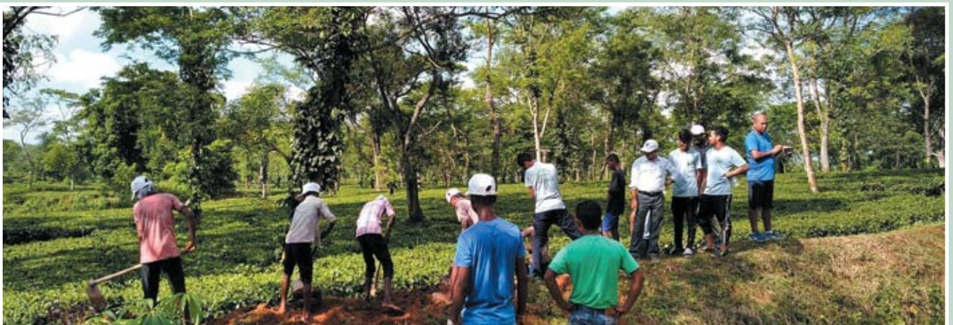
Digging under dangerously sagging electric line in garden areas