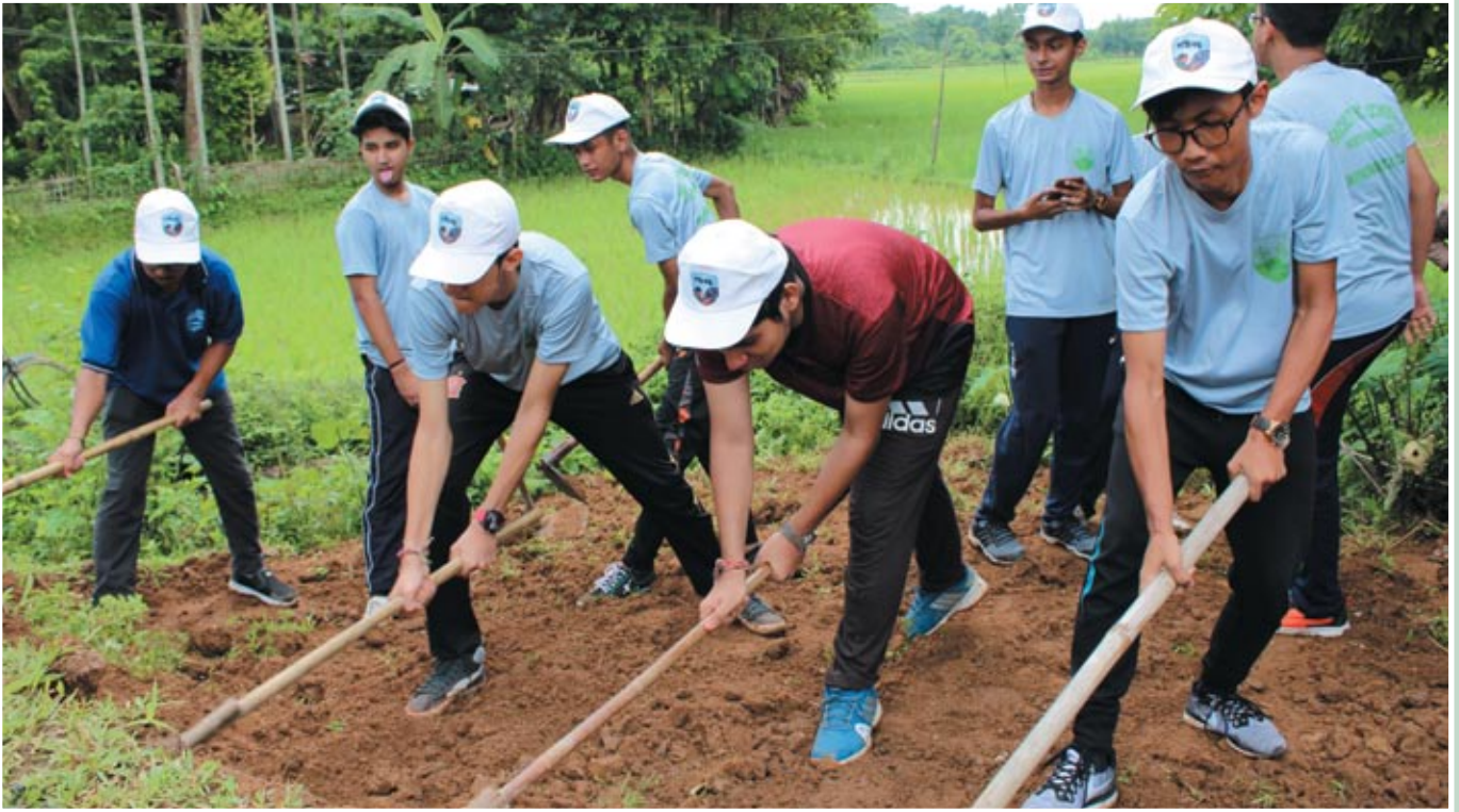
Students of Faculty H.S.S (FHSS) North Guwahati digging under dangerously sagging lines